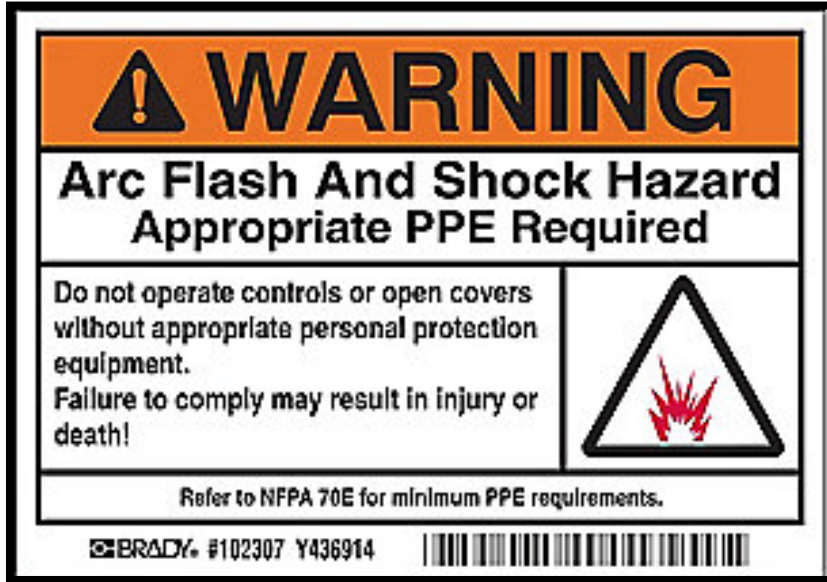
Figure 2. Permanent Arc Flash and Shock Hazard Label (2009 Edition)